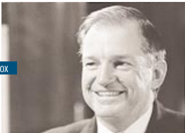
PRODUCTS Neville Cox